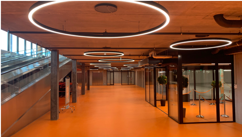
View of elevator foyer