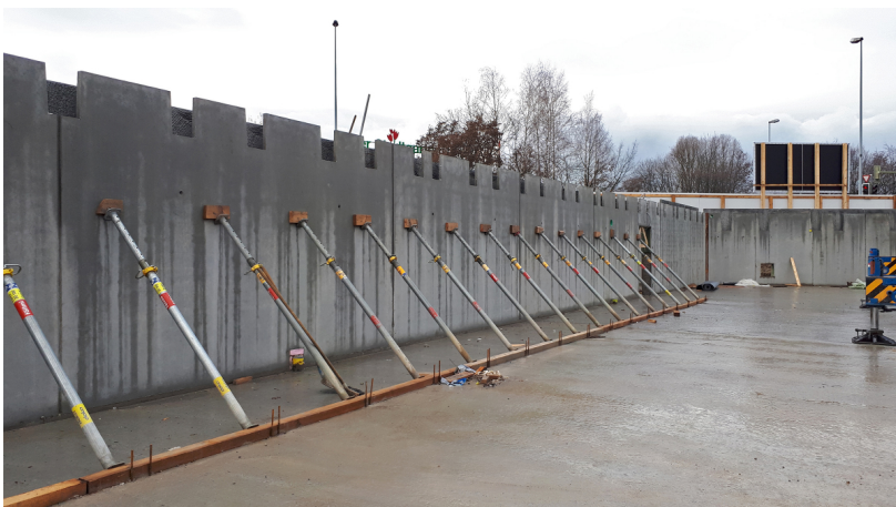
Semi-finished walls