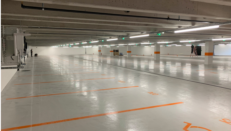
View of underground parking garage