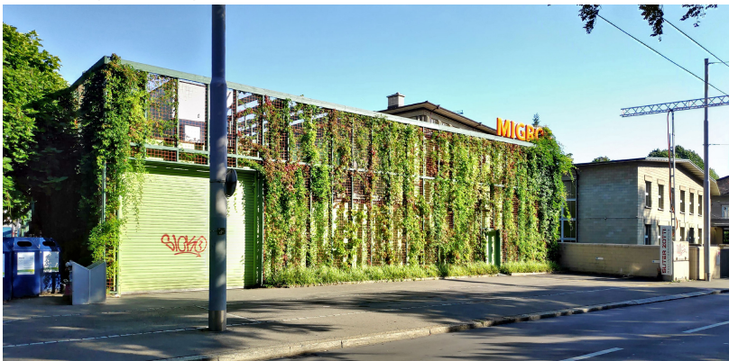
Green façade cools warm air rising up from the street space (Temporary Migros Store at Kreuzplatz)

Every year, the Zurich CPO oversees between 20 and 40 architectural-design competitions and planning-firm calls to tender. The decisions that are made in the context of these procedures (e.g. concerning building orientation, green-space allocation, materials selection, and façade design) are certain to have a significant impact on the city's climate. In our project, we examined what can be done in general in the area of project planning to achieve climate-smart solutions. We also accompanied the organizers of a two-stage design competition for a prominent development project (Triemli-Goldacker) to assess specific efforts to integrate urban-climate concerns into the competition process.