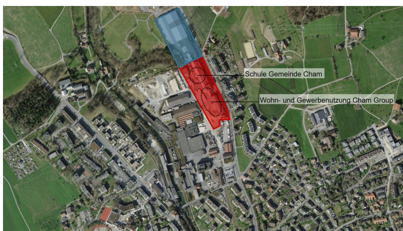
Perimeter representation, EBP