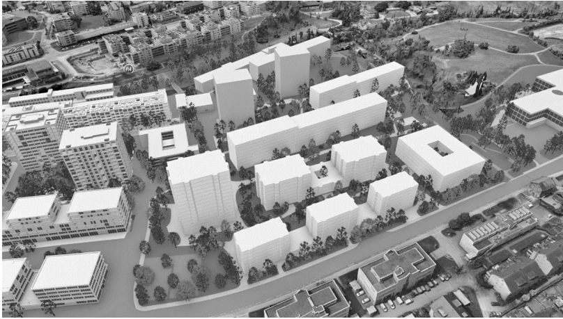
3D model (Raumgleiter AG) of the winning project (ARGE Ramser Schmid und Enzmann Fischer)