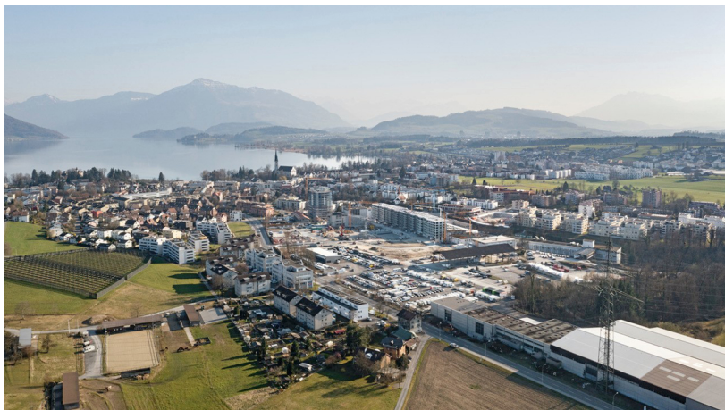
Aerial view of Papieri and Pavatex Süd site development: photograph by Beat Bühler