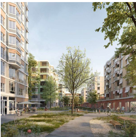
Visualization 2 of the winning project (ARGE Ramser Schmid und Enzmann Fischer)