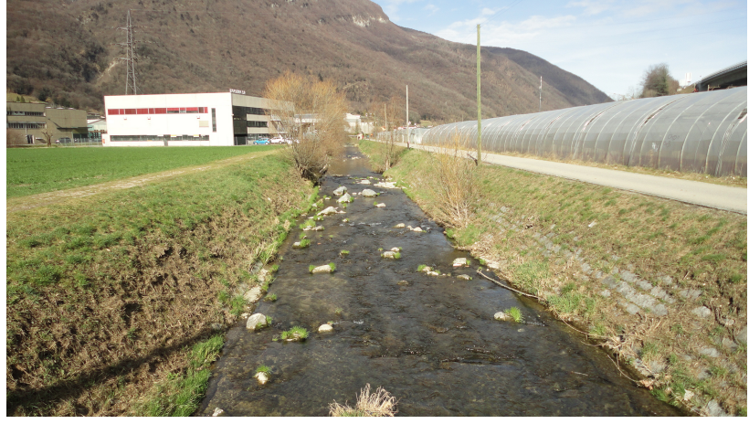
View in direction of River Laveggio close to the sewage treatment plant

While all of the many stakeholders agree that the Laveggio's current state is unacceptable, their proposals for its development and use diverge. Conflicts relating to the river's future therefore seem unavoidable.