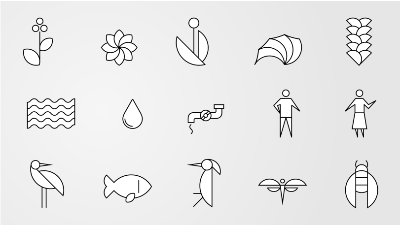
Bregalnica River Basin Management, SECO