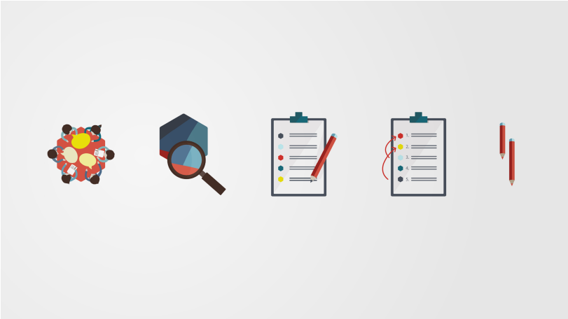
Urban flooding, icons for posters displayed at the Interpraevent Congress at the Lucerne Culture and Congress Centre (KKL)