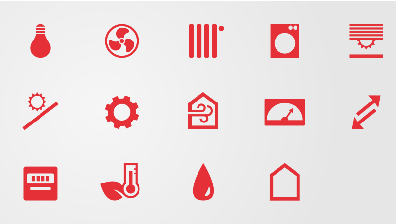
Minergie topic icons