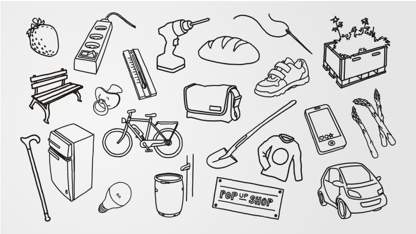
Sufficiency toolbox, Swiss PUSCH Foundation