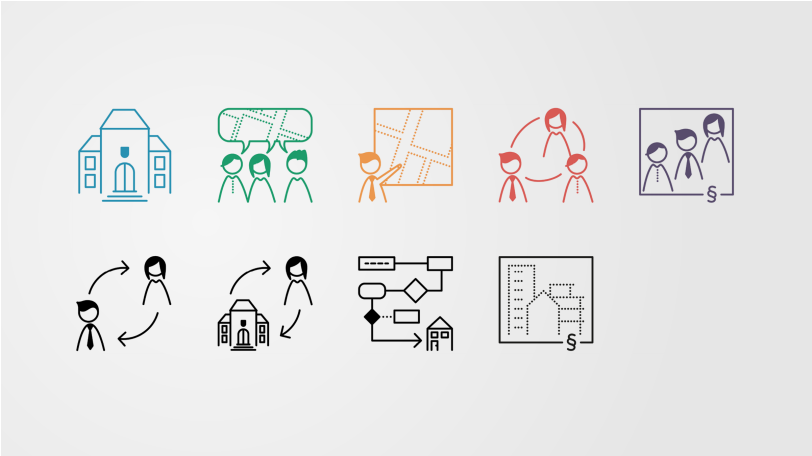
Internal development, BaslerFonds