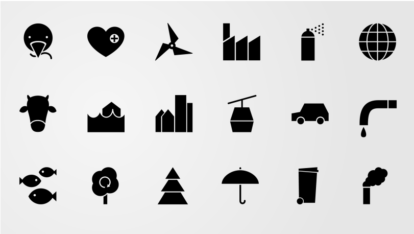
Climate report, Canton of Graubünden