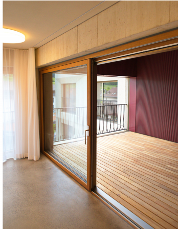
The new building meets the Minergie-Eco standard