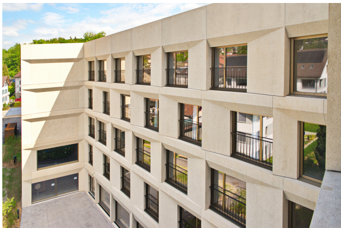
The new building meets the Minergie-Eco standard