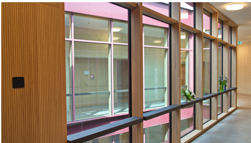
The new building meets the Minergie-Eco standard

The project, now known as the “Rosenthal Health Center”, has been awarded the “bestarchitects24” prize in the public buildings category.