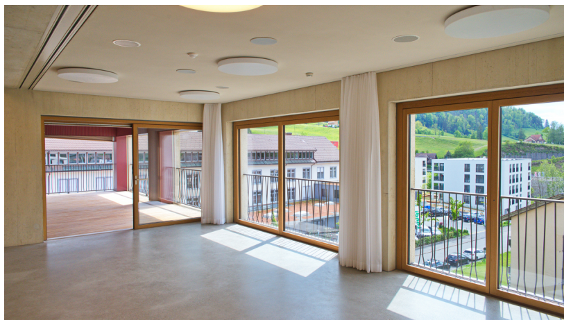
The new building meets the Minergie-Eco standard