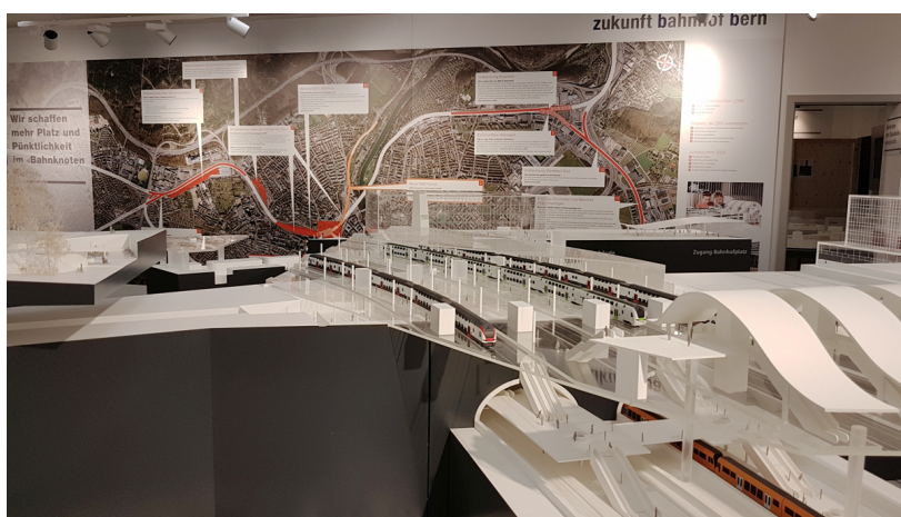
Showroom presentation of a model of the new train station