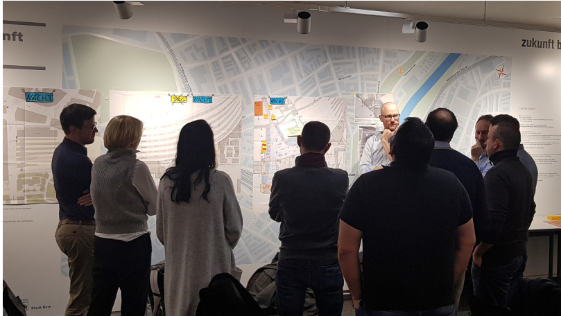
Discussions of daytime and nighttime security moderated by EBP, including workshops