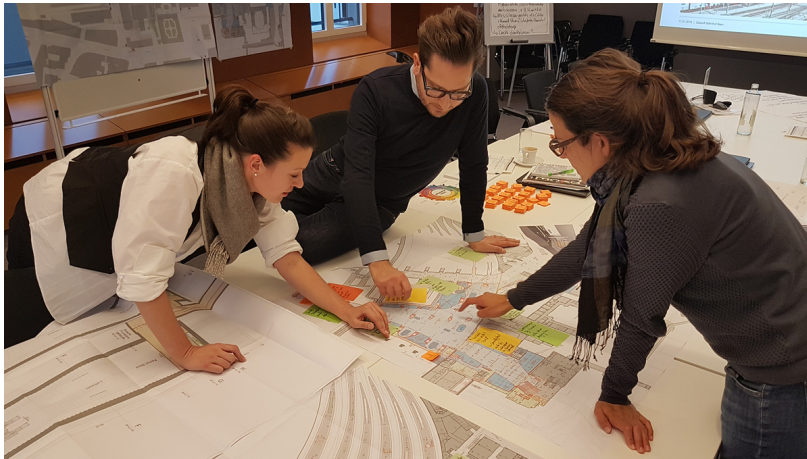
Internal workshop at EBP with our urban-psychology team