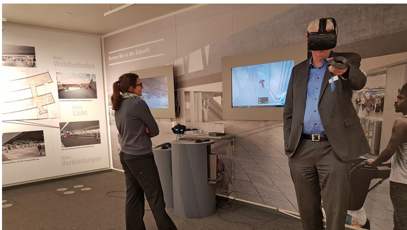
Virtual walk-through of the new train station in our showroom