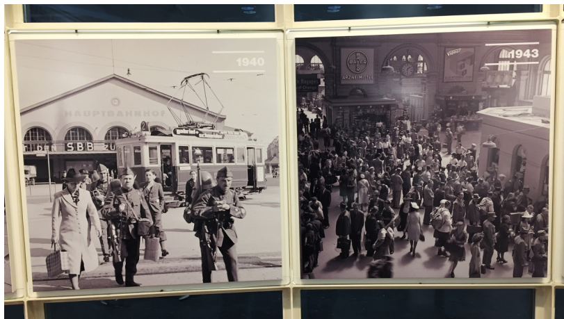
The Bern train station around 80 years ago