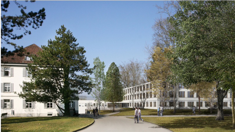
Visualisierung Wettbewerb: Bollhalder Eberle Architektur / Play Time, Barcelona