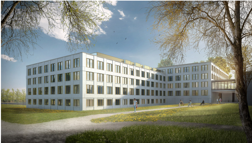
Visualisierung 2019: Bollhalder Eberle Architektur / Loomn, Gütersloh