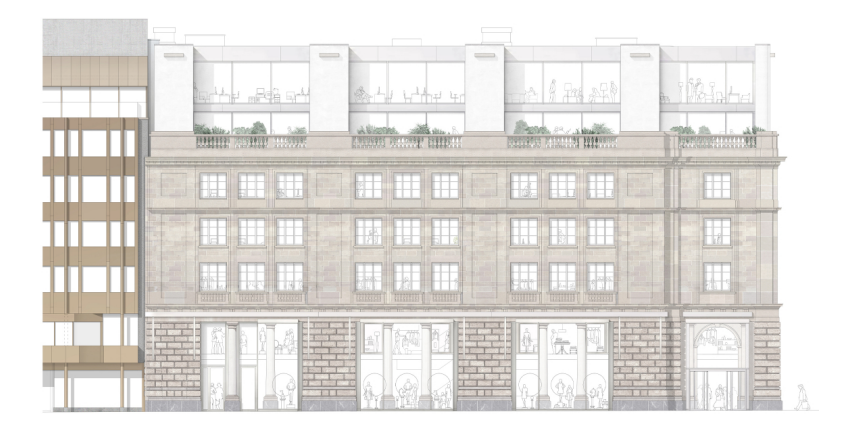
View from Bahnhofstrasse