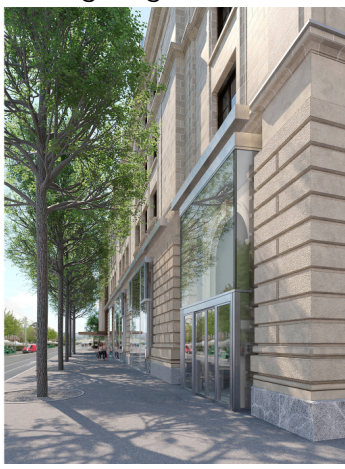
Building entrances on Bahnhofstrasse

the ground floor, were planned to meet highly demanding security specifications. With exposed all-glass borders, they meet the highest of architectural standards while also ensuring maximum transparency. The extensive glass façades, framed in stainless steel, on the two-story penthouse level are complemented by fabric sunshades. The inner courtyard is defined by story-high windows, framed in aluminum and secured with fall-prevention structures. The atrium is roofed over at the level of the mezzanine's ceiling with a skylight that provides ample natural lighting.