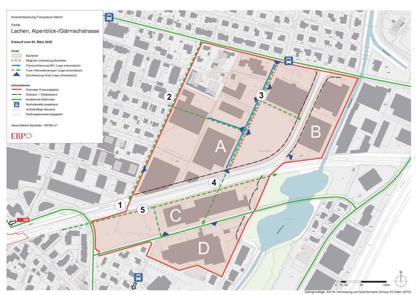
Site profile for possible development in the municipality of Lachen