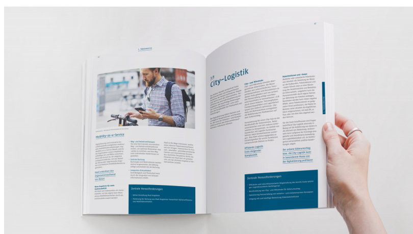
Ample use of images and info-boxes helps to highlight the relevant contents.