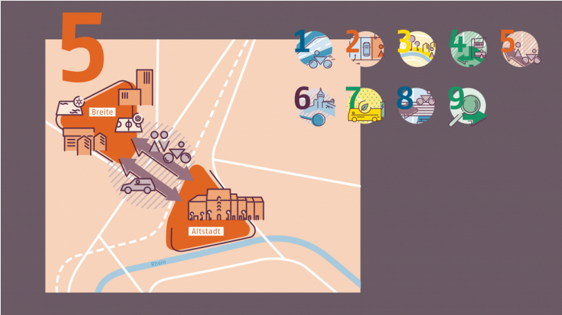
Infographic about the main link between the city center and Breite.