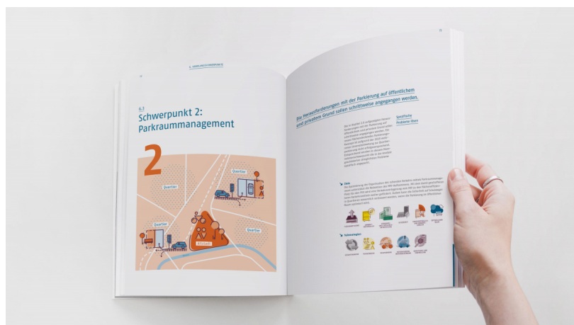
A special focus is placed on the main goals. Intuitive infographics support efficient communication.