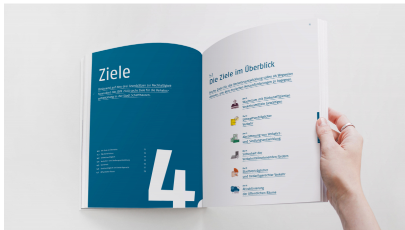
All goals at a glance

essential content, including the nine main goals