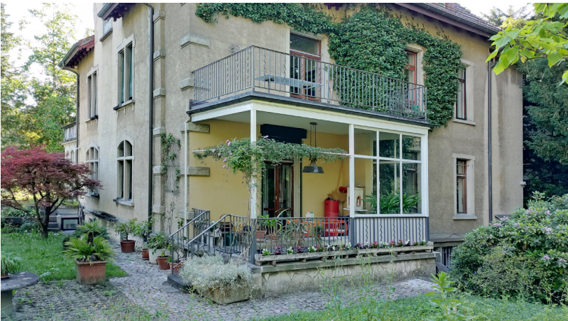
New brine/water heat pump to meet the historic villa's heating needs