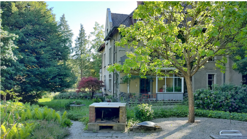
Drilling of geothermal probes completed in garden