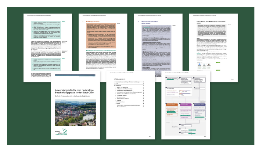
Pages from the guidance on sustainable procurement in the City of Olten