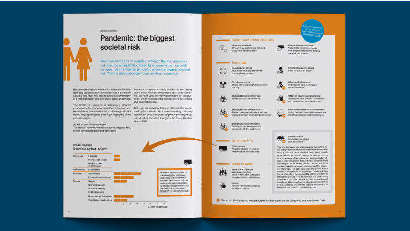
Overview and trends relating to “societal” risks