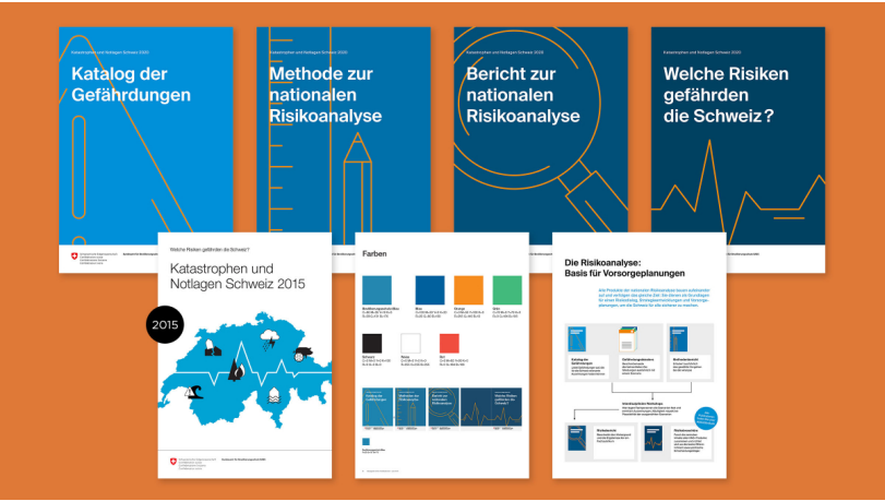
With a consistent design concept, we made the affiliation of the various publications clear, thus ensuring better orientation.