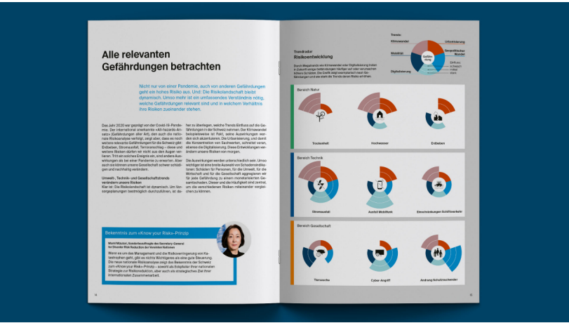
Trend radar on risk development: What megatrends have the potential to exacerbate the risks?