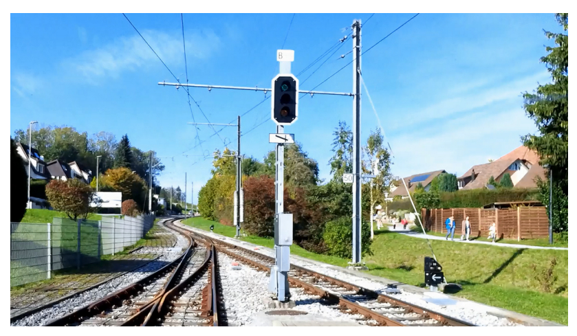
Forchbahn AG video excerpt: departure from Esslingen Railway Station