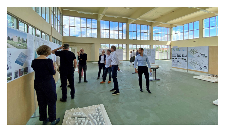
The jury deliberations at the development site