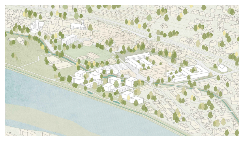
Axonometry of the winning proposal submitted by Burkard Meyer and ASP