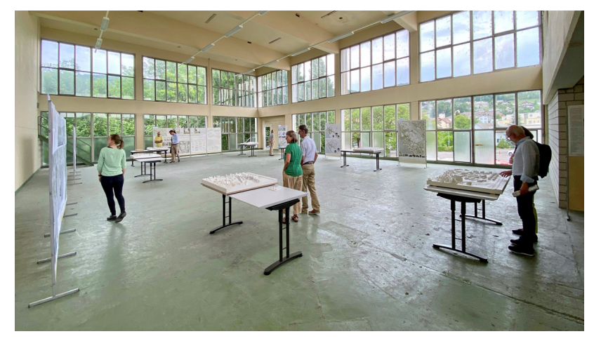
On-site exhibition of the development proposals