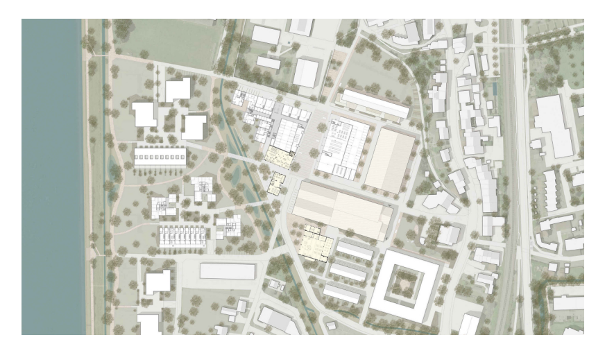
Site plan of the winning proposal submitted by Burkard Meyer and \ensuremath{\mathsf{ASP}}