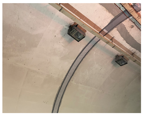
Site management waterproofing block joints