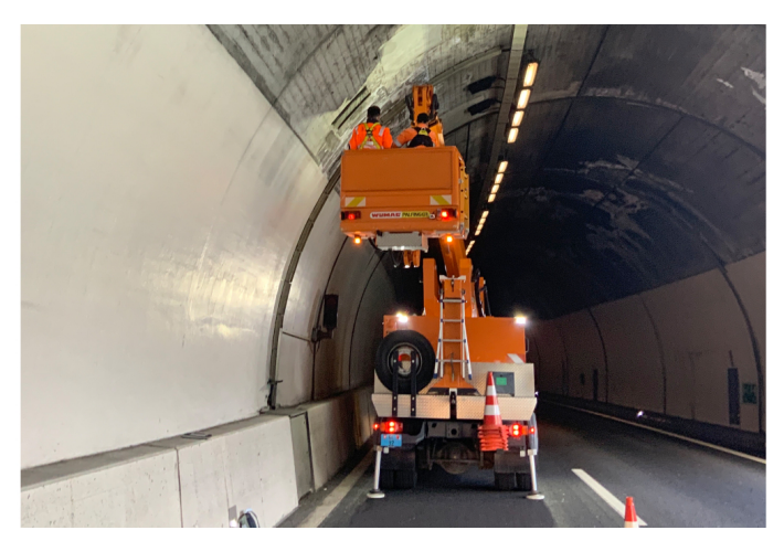
Tunnel condition inspection