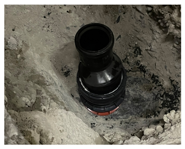
Site management for tunnel drainage repair