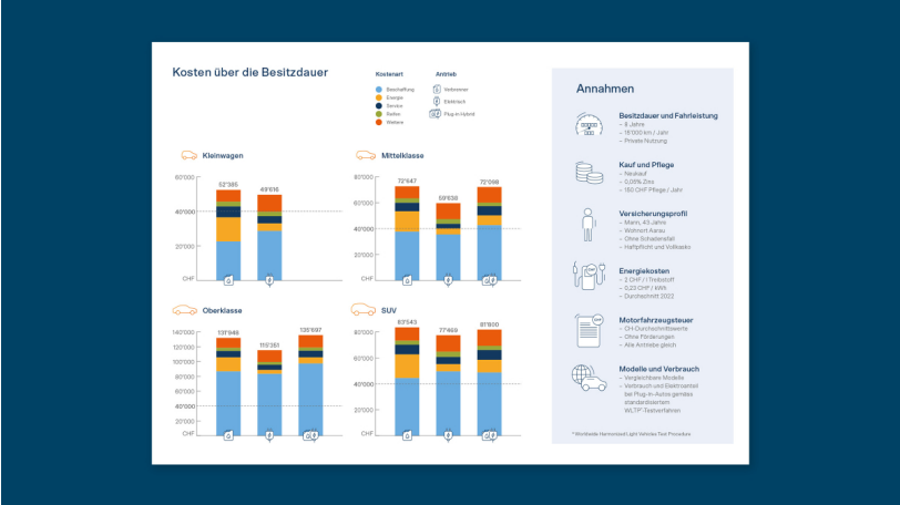
Cost of car ownership by propulsion type and size class