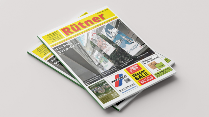
Public relations & media work regarding the municipal strategy