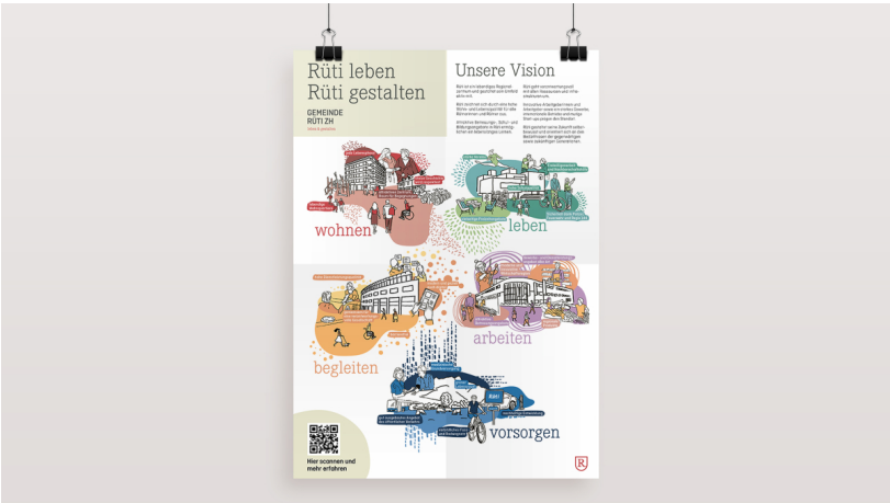
Creating PR materials