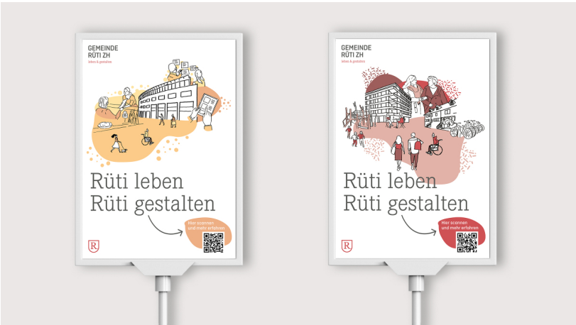
Creating PR materials