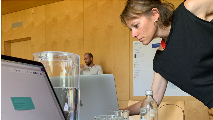
System map workshop in Zurich