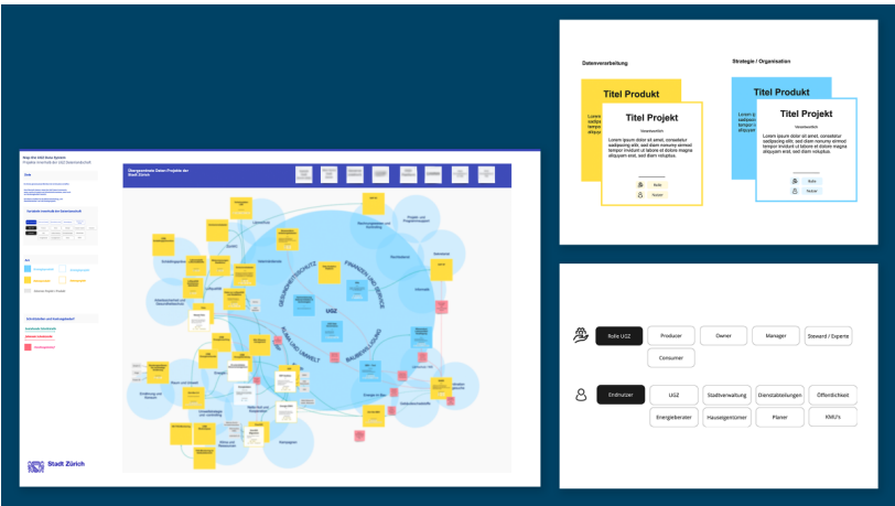
Final product and templates