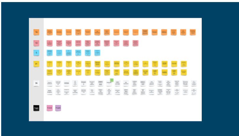
Color-coded overview of inputs