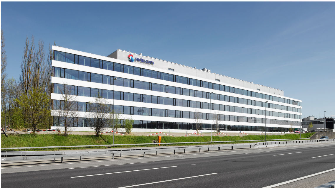
Building-Award 2015 für Neubau Swisscom Businesspark

With electrotechnical systems playing a central function in the operation of our buildings and installations, electrical engineering is becoming ever-more important. Our work in this area is focused primarily on analysis and consulting services for all aspects of electrical technology and energy optimization in the industrial, infrastructure and real estate sectors.