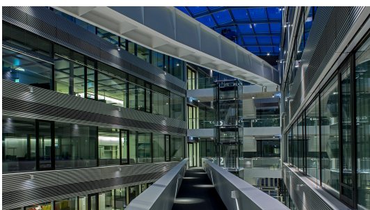
Building-Award 2015 für Neubau Swisscom Businesspark