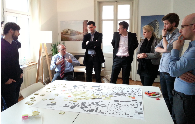
Moderated discussion of the crime prevention assessment by the participants.

The crime prevention plans for the AQA is currently unique within Switzerland. Security issues had not previously been considered so comprehensively or in such depth in district planning.