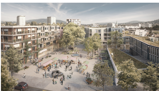
Evaluation of land-lease developers for 13 plots in the municipality of Birsfelden (visualization: central plaza, new Birsfelden town center, October 2021 © Harry Guggler Studio, Basel | Westpol Landscape Architecture, Basel | Visualization: Nightnurse Images, Zurich)