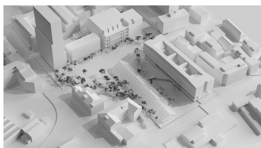
Koch development site: coordination of developer