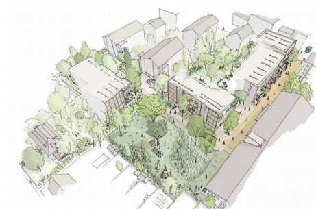
Evaluation of land-lease developers for four plots at the "Hardstrasse" site in Birsfelden (Design Concept, © 2019 Salewski & Kretz Architects, Zurich)